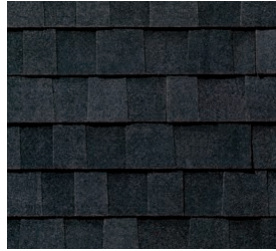
Titan XT™ Rustic Black