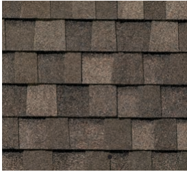
Heritage® Weathered Wood

* Please consult TAMKO's Limited Warranty and Application Instructions for any requirements or limitations.