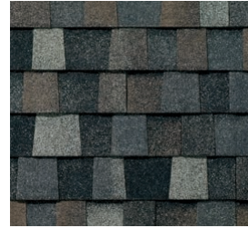
StormFighter IR™ Thunderstorm Grey