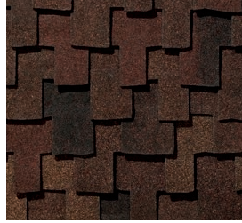
Heritage® Vintage® Rustic Redwood