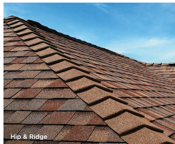
Hip & Ridge