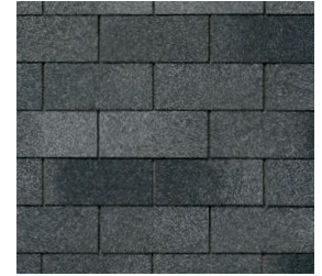
Elite Glass-Seal® Antique Slate