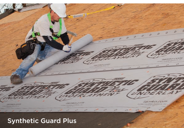
Synthetic Guard Plus